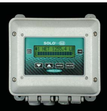
THE SOLO G2 DIGITAL WEIGHT INDICTOR IS SIMPLE TO OPERATE AND INCLUDES 4-20MA OUTPUTS