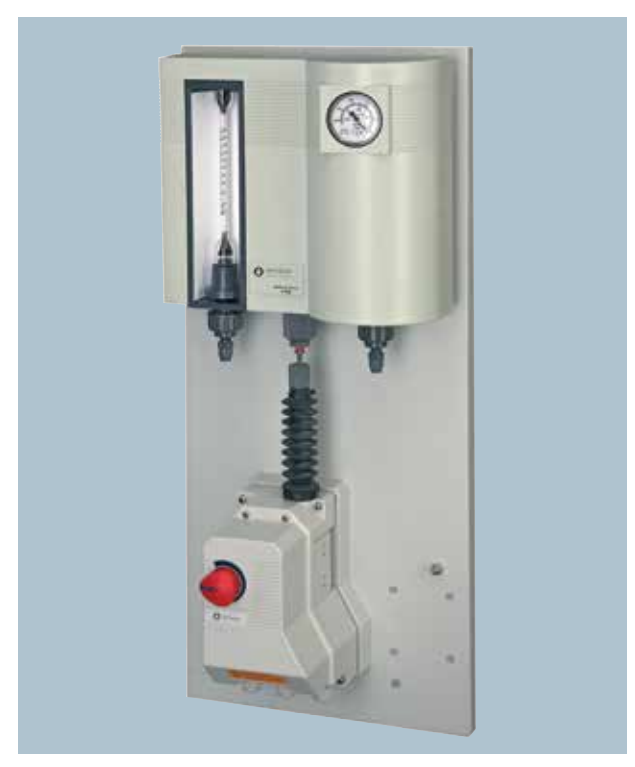
PRE-ASSEMBLED INSTALLATION OF THE V10K AUTOMATIC SYSTEM

With the V10k<sup>™</sup> system the following control modes are available: