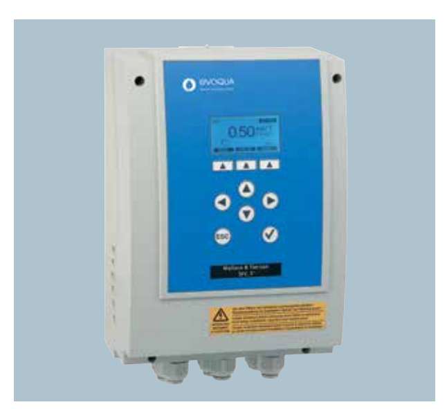
SFC MEASUREMENT AND CONTROL SYSTEM