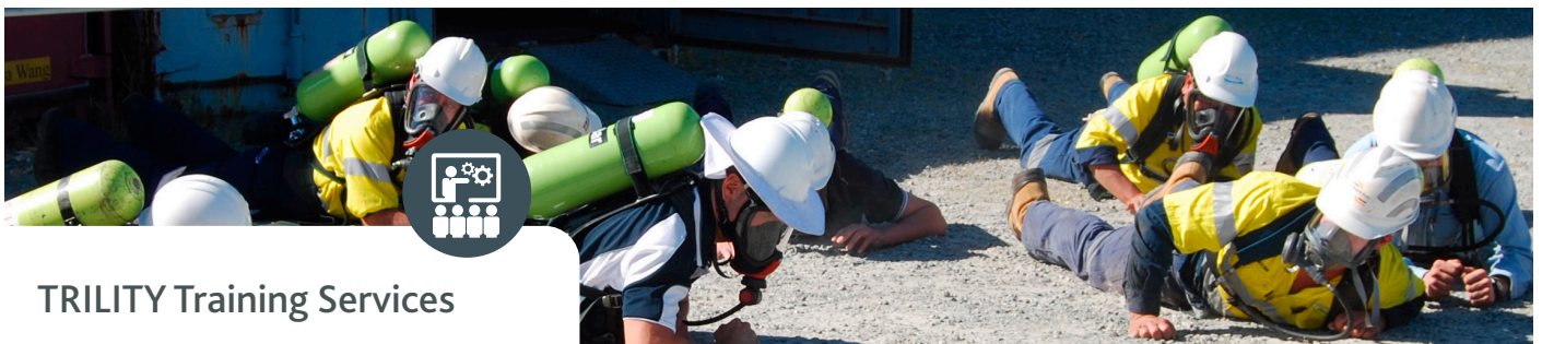
TRILITY Training Services