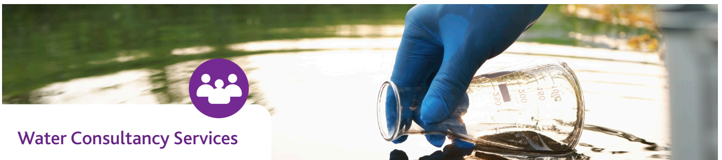
Water Consultancy Services