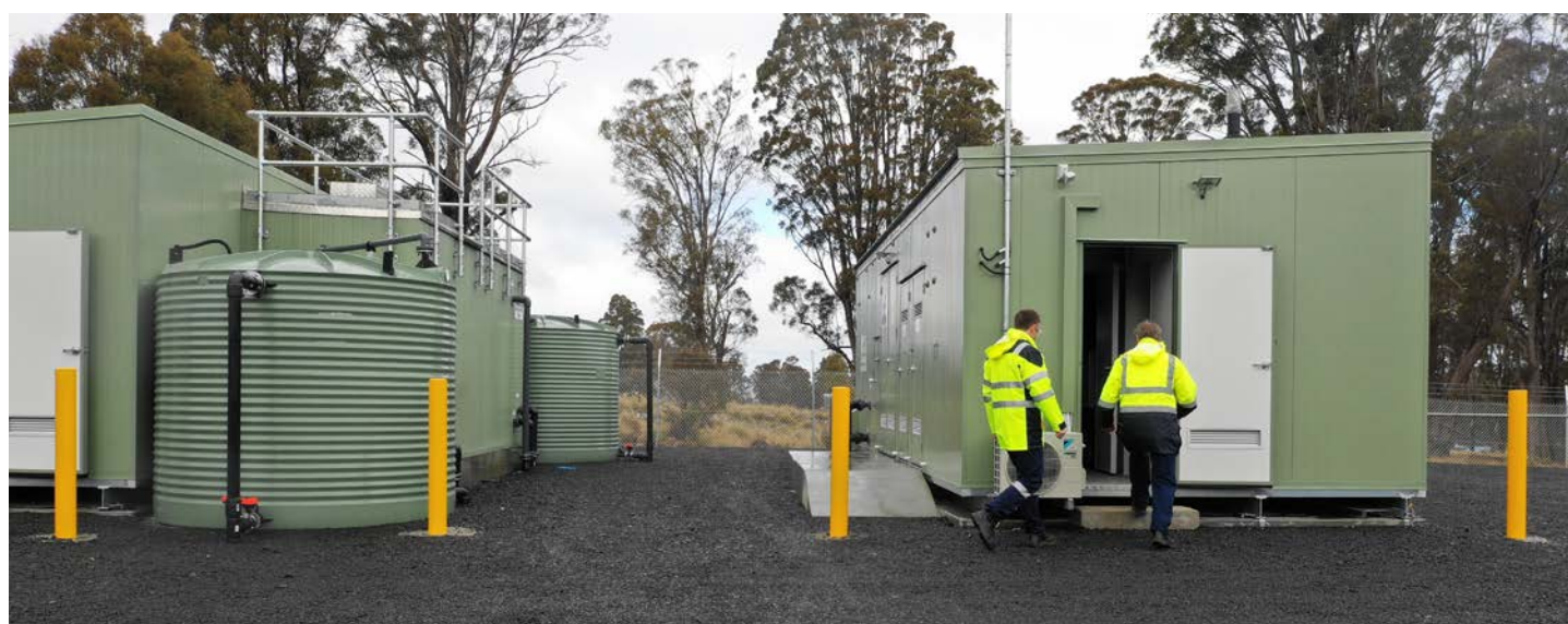
Modular water treatment plant in Tasmania