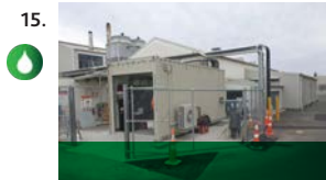
Hawke's Bay District Health Board Main Water Supply and Treatment System TRILITY was engaged to design, build, install and commission a bespoke modular water treatment plant at the Fallen Soldiers' Memorial Hospital in Hastings that is capable of providing 1.3 ML/d of compliant drinking water.