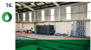
Rotorua wastewater treatment plant poly dosing system TRILITY designed and built a poly dosing system as part of an upgrade to a sludge dewatering building at a wastewater treatment plant. The solution has helped the operators of the plant achieve reduced sludge handling costs with less operator effort.