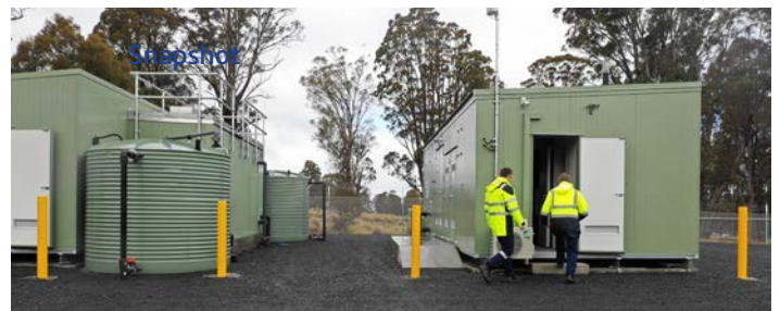
TasWater Regional Towns Water Supply Program WP-1, Bronte Park