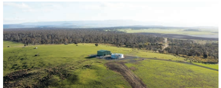
TasWater Regional Towns Water Supply Program WP-1, Conara