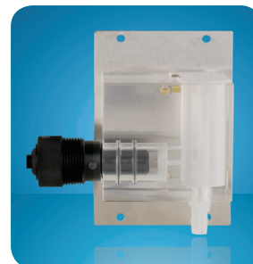
Constant Head Flowcell